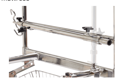
The IV stand (accessory) folds away

Trendelenburg angle -14° Backrest length 75 cm Back rest angle 71° Weight 68 kg Max patient weight 200 kg