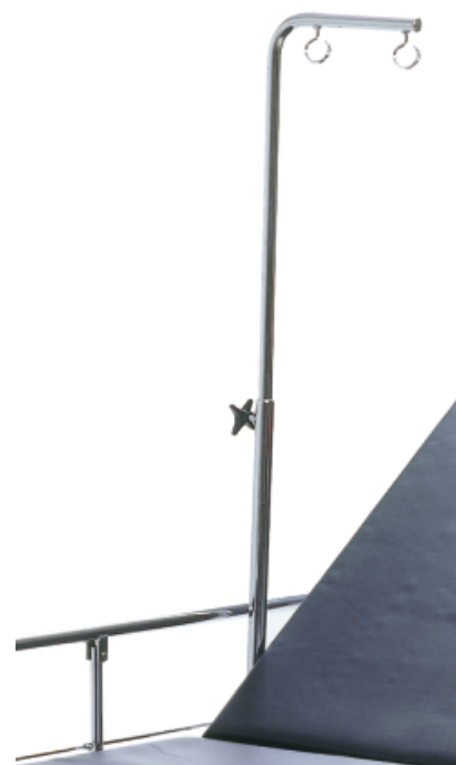
IV stand, accessory