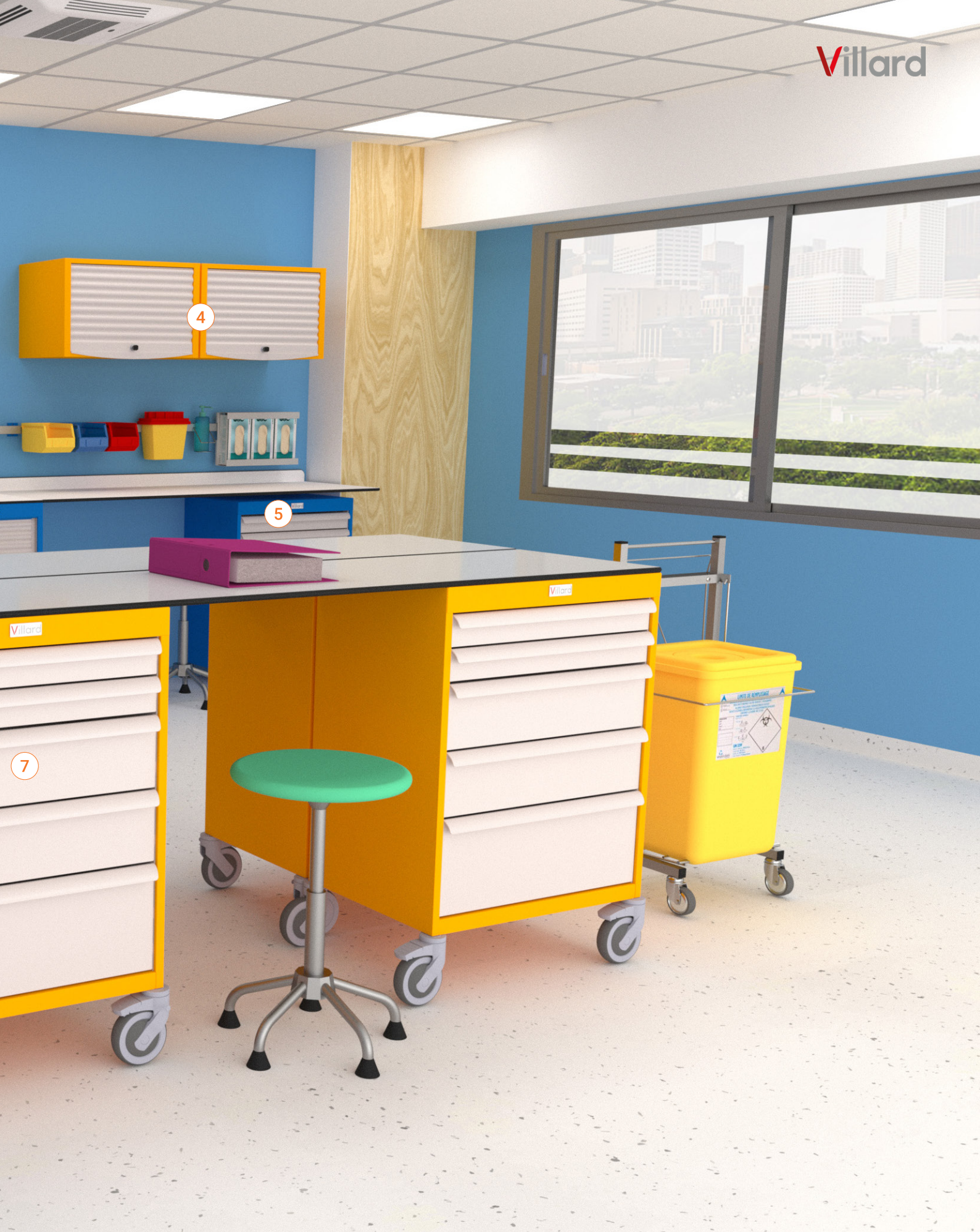
5. Drawer bloc - mobile with drawers, 9 levels (réf. 1007.20) p.48 + accessories p.52 6. Multifonction cart - 600x400, 9 levels with roller shutter (ref. 1006.11) p.12 + interior accessories p.20 to 23 , 7. Mobile workstation - with drawers, 2 x 9 levels with central space (réf. 1007.14) p.44 + accessories p.46 & 47 .