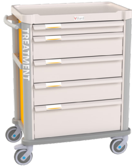
Modular Cart 600x400