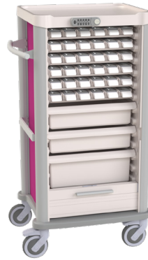
Modular Cart COMPACT