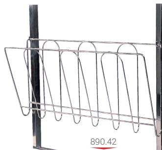
→ Support for sterilization sheets or files Structure in 18/10 stainless steel wire. DIM. 600 x 145 - Height 320 mm