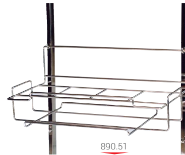
→ Support for sterilisation container Structure entirely in 18/10 stainless steel. 2 levels: upper level for the container, lower level for storing the lid. DIM. 640 x 340 mm - Height 240 mm