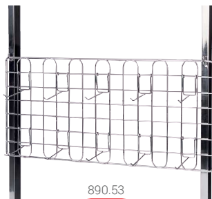
→ Support for surgical instruments 18/10 stainless steel wire grid Supplied with 10 stainless steel hooks 100 mm long. DIM. 600 x 280 mm