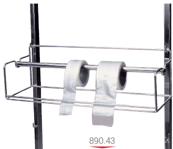
→ Roll holder Structure in 18/10 stainless steel wire. Sealed central axis. DIM. 600 x 205 - Height 180 mm