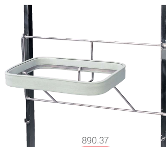
→ Laundry or waste bag holder Frame in 18/10 stainless steel equipped with a universal elastic ring to hold the bag. DIM. 600 x 360 - Height 260 mm