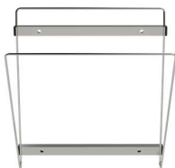
Ref. SMI 50/120

Single wall holder for 50L bag (screws not supplied)