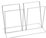
Ref. DSI 10/20