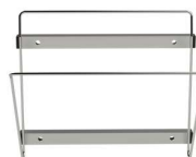
Ref. SMI 30

Single wall holder for 20 to 30L bag (screws not supplied)