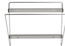
Ref. SMI 50

Single wall holder for 30L bag (screws not supplied)