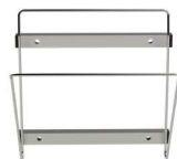
Ref. SMI 20/30

Single wall holder for 10 to 20L bag (screws not supplied)