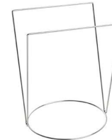
Ref. SSI 110