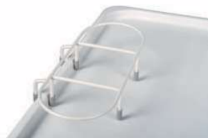
3 cases bottle holder