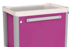
Rail for cart

standard stickers: MEDICATION, TREATMENT, ANAESTHESIA 1600.44 customized stickers (max. 14 characters) 1600.45