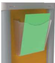
Patient file holder