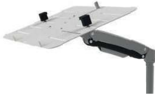
Height-adjustable reclining arm with secured tray for laptop