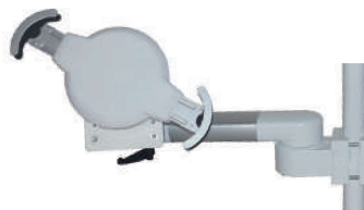
Antimicrobial touchpad support + add VESA support (see above)