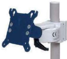
Antimicrobial VESA support + add Ø 30 mm pole - Ref. 1500.80