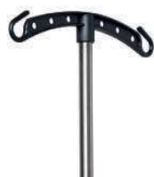
Height-adjustable IV pole with 2 curved plastic hooks

10L 15L Simple 1501.24 1501.25 Double 1501.26 1501.28