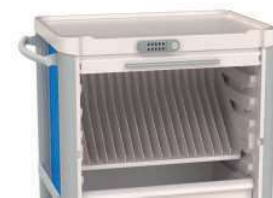
Medical files holder for cart eolis® 600x400 Capacity: 18 cases