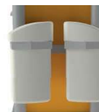
Waste bin with removable lid & support

20L 30L Simple 1501.22 1501.23 Double 1501.18 1501.19