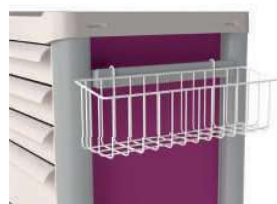
Lateral wire baskets

DIM. L X W H.55MM H.130MM 345 x 90 mm 1500.32 1500.33 345 x 130 mm 1500.34 1500.35