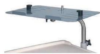
Height-adjustable fixed arm with secured tray for laptop