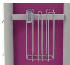
Refuse bag holder with clamp for lateral rail

400 x 100 x H. 100 mm 494.21 400 x 200 x H. 150 mm 494.23