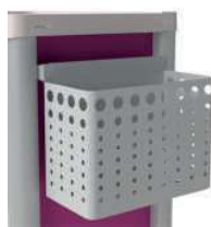
A4 medical files holder for cart eolis® COMPACT Height: 6 levels