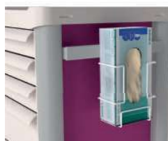
Gloves box holder

simple 1100.74 double 1501.36 triple 1501.35