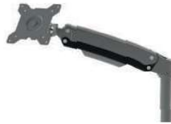
Height-adjustable reclining arm with VESA holder for screen/PC panel