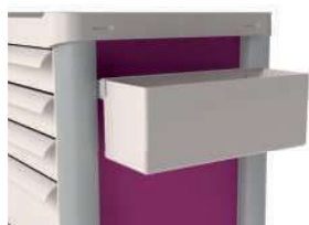
Lateral plastic boxes

sharp container holder 1101.97 sharp box 1L 920.01 sharp box 1.8L 920.01