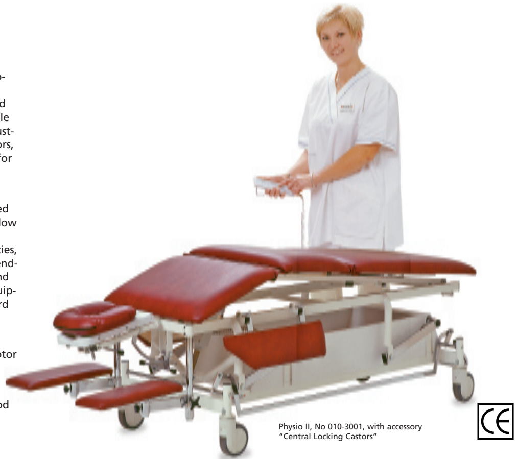
Physio II, No 010-3001, with accessory "Central Locking Castors"

Full length: 195 cm Leg section: 80 cm Middle section: 38 cm Front section: 42 cm Headrest: 35 cm