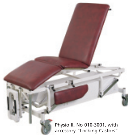
Physio II, No 010-3001, with accessory "Locking Castors"