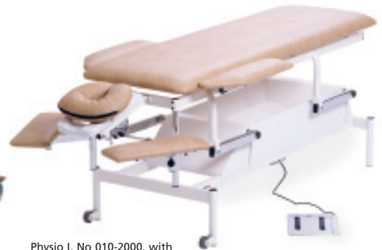
Physio I, No 010-2000, with two front castors (standard)